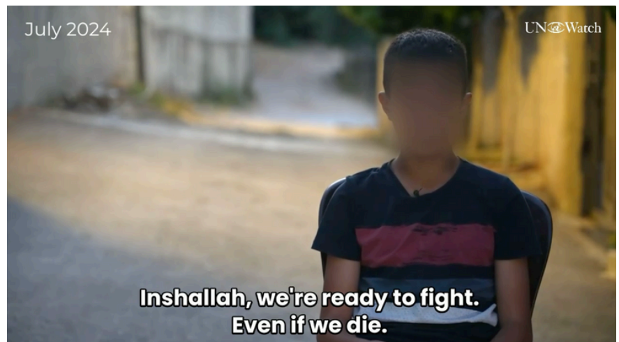
Student at UNRWA's Jalazone Boys' School in an exclusive interview obtained by UN Watch.